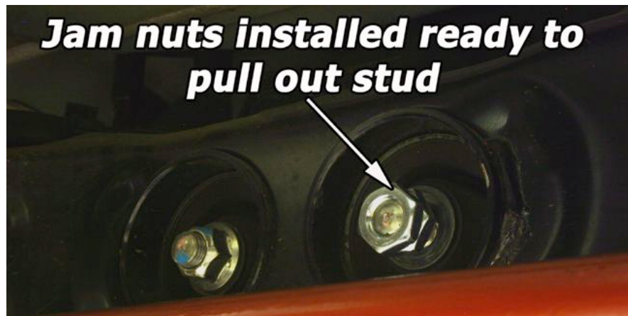
Shows nut removed, and jam nuts installed ready to remove stud from diff cover.