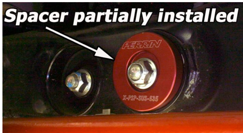
Shows spacer held in by bolt and nut, ready for first step in pressing spacer in.